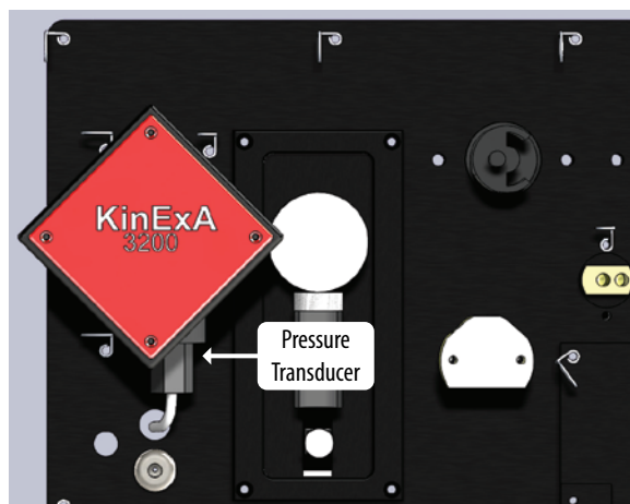
Figure 1. Pressure transducer block behind the KinExA 3200 logo.